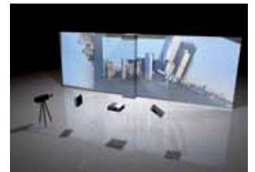
Automatic Stacking, Softedge and Warping

Why not save time, your nerves and money and make your presentations with Wings VIOSO , enjoying a level of quality hitherto unknown! We are happy to demonstrate our systems and to sit down with you to find new possibilities tailored to your needs. We look forward to the challenge. Please do contact us!